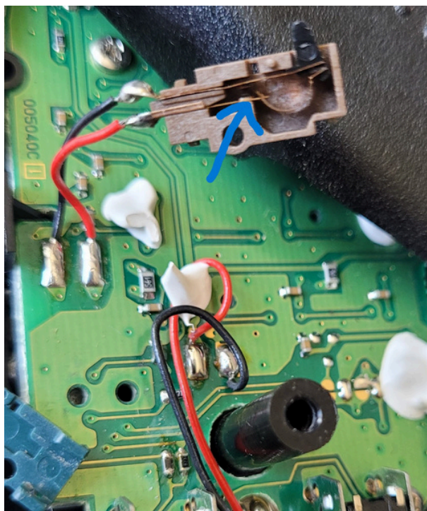
Photo 4 (left): microswitch enclosure opened showing the PTT contact