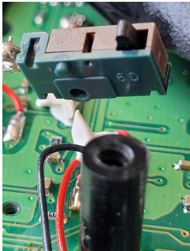
Photo 3 (right): The microswitch was easily removed from the circuit board