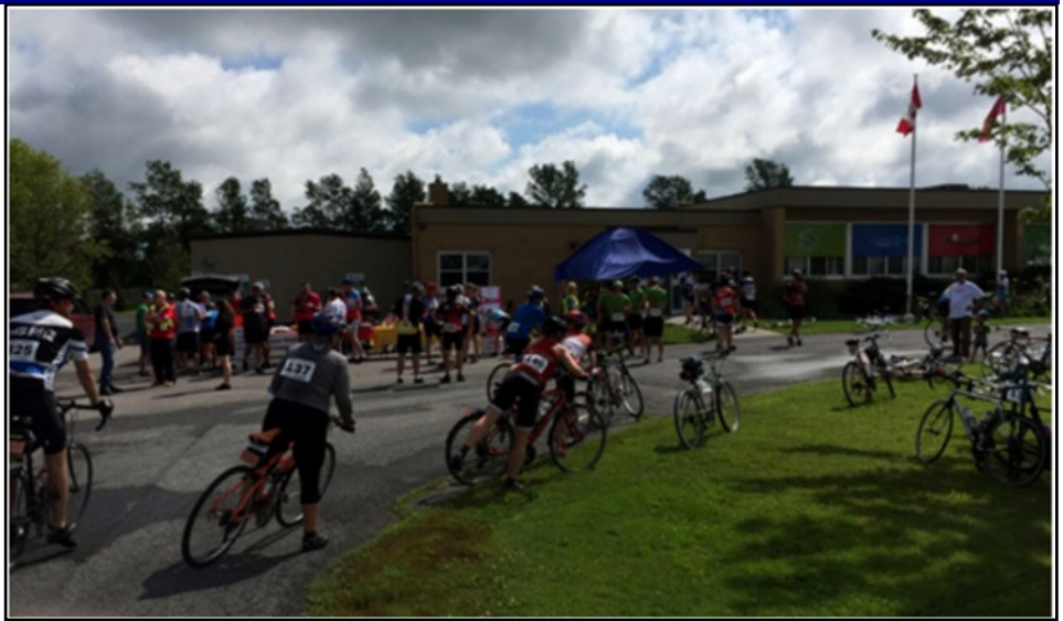
Bikers come into midway rest stop at Finch