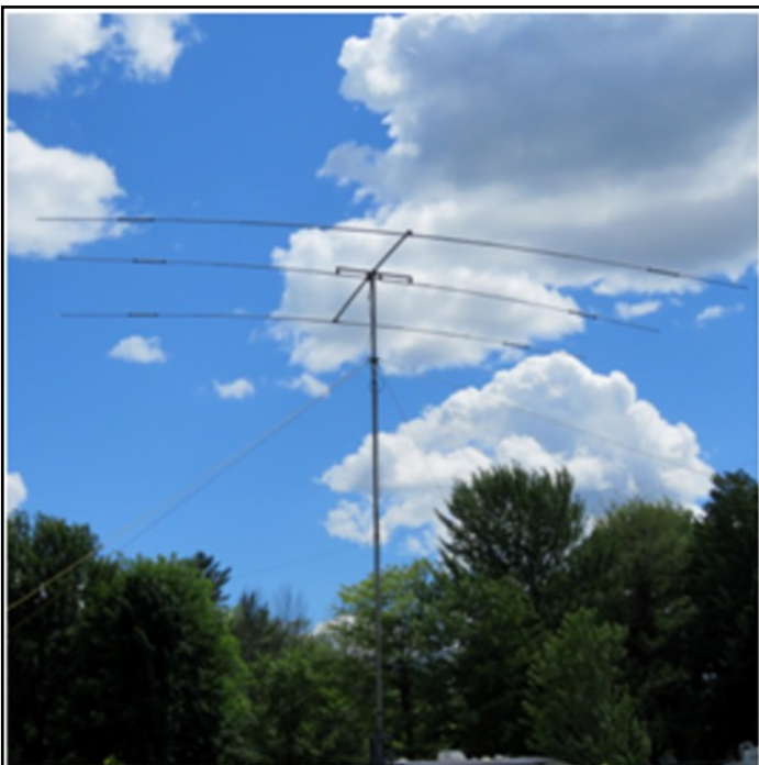
20-15-10 metre beam antenna