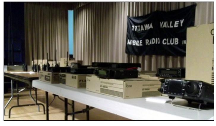
The equipment brought by Dannis was spread out over three tables. Mobile radios were on display on the first table, portable radios on the second and accessories on the third.