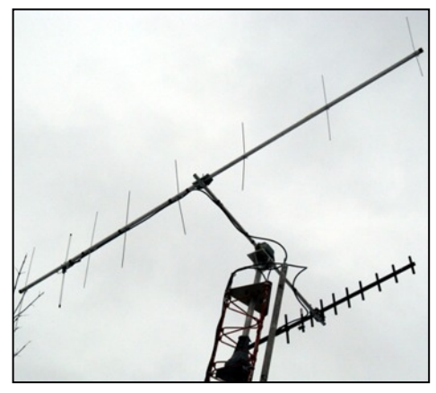
VE2DBX satellite antennas and rotors

Yagis, mounted them on an azimuth rotor placed horizontally so that he could servo it up and down for elevation. Below this rotor, he used another azimuth rotor to turn his antennas 360 degrees. He built a control box for the two rotors and showed me the professional drawings that he drafted for the control. He used Sun readings to orientate his system.