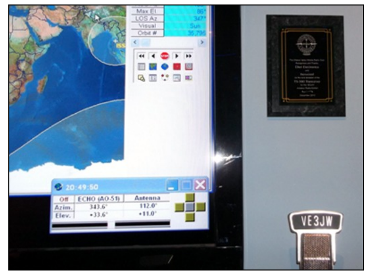
A plaque commemorating the donation of ELKEL to VE3JW, on the wall next to the large monitor, for permanent display at VE3JW.