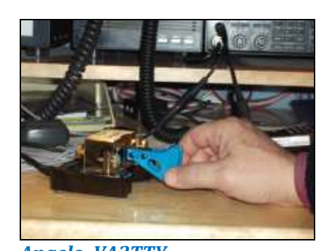
Angelo, VA3TTY

The extra operator was for when the museum was open to the public to answer any questions that might occur as not to distract the operators who were busy making contacts and breaking pileups. We had one operator on the new Flex Radio operating on 6-10-15-20 CW or SSB depending on the operator's preference. We had one operator on the TS 2000 operating 2, 40 and 80 CW or SSB depending on the operator's preference and one operator on 2m FM using the Kenwood D700.