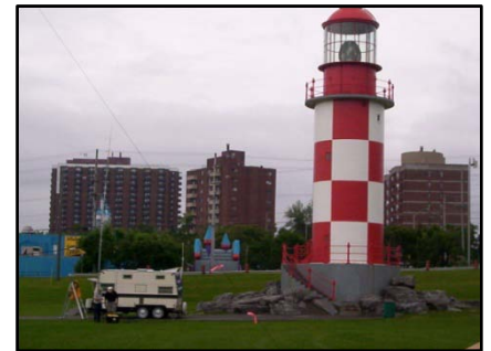
Field Day 2010