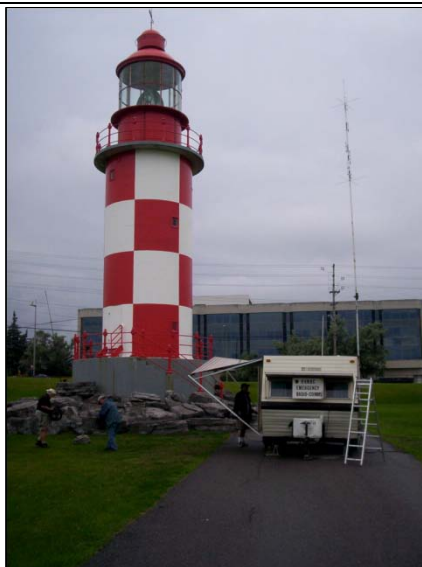
Field Day 2010