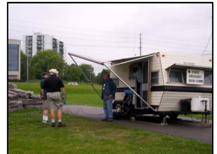
Field Day 2010