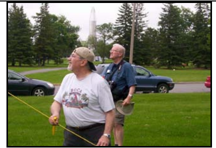
Field Day 2010