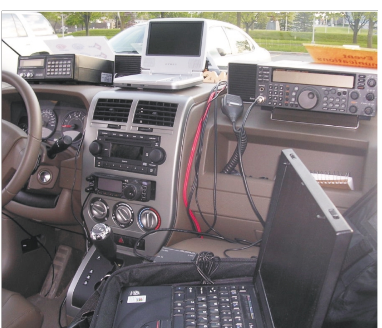
down VA2MA mobile, not the set-up in the story, but similar.

trol on their handheld radio, I was wondering if perhaps I was interfering with their surveillance and security communications network for the shopping centre. They have walky-talky systems and cheap surveillance cameras all over. Perhaps my RF was getting into that. But to me, that was a fragrant abuse of authority due to phobic reactions to current events.