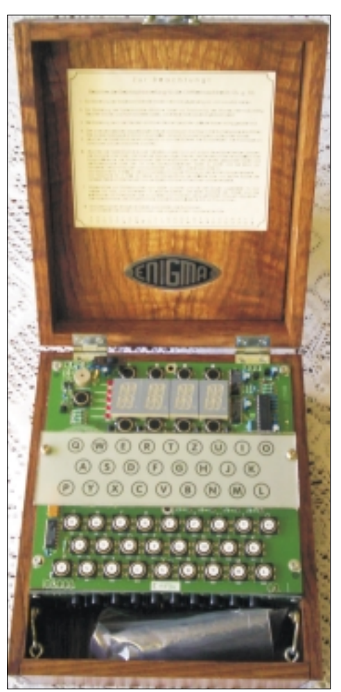
The Enigma-E with its finished wooden

At the end it makes a nice replica which is truly operational. Of course, you cannot really use it over amateur radio frequencies because encrypted traffic is forbidden. 73!