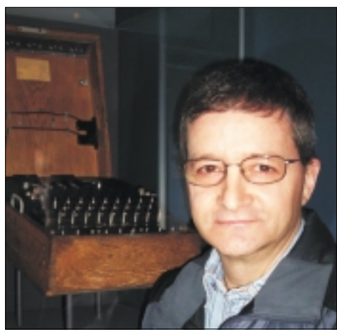
The author snapped with an M4 Enigma encryption machine at the Canadian War Museum.

You can closely look at an Enigma machine at the Canadian War Museum in Ottawa in the Atlantic battle section of the World War II gallery. It is a nice 1943 M4 Enigma machine with four wheels that was used by the German navy.