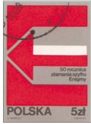
A stamps issued in 1983 by Poczta Polska to commemorate Polish decipherment efforts of the Enigma machine.

repeated twice at the head of each message, but encrypted with a daily secret key. To commemorate the 100th anniversary of Rejewski's birth, Poczta Polska issued a prepaid postcard 2005. This was in addition to a 1983 stamp commemorating the 50th anniversary of Polish decipherment efforts of the Enigma machine.