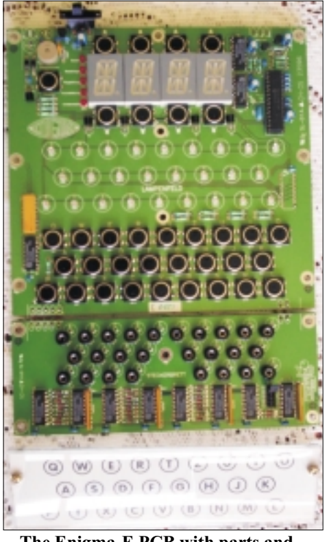
The Enigma-E PCB with parts and plexiglass lamp board.

I assembled my own electronic Enigma using the Enigma-E kit (www.xat.nl/enigma-e). The kit comes with a PCB, parts and assembly instructions. The level of difficulty is moderate (no surface mount parts) and require few hours of assembly and debugging work. A picture shows my unit assembled. The main PCB consists of 26-letter keyboard and 26-letter lamb board. The small attached PCB, attached to the main PCB, is the plug board. The electronic kit can be ordered online from the Bletchley Park museum