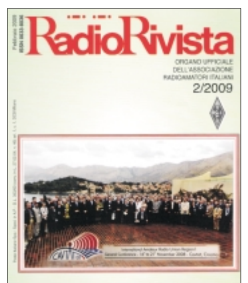
La Conferenza IARU e la Regione 1 Oscillatori di riferimento ultrastabili Desecheo 2009