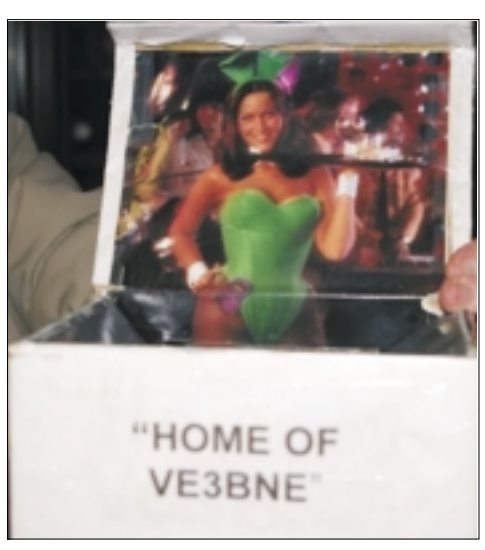
The bunny box

Antennas used for hunting were varied. From a handheld with, and without, the rubberduck to three-element beams on