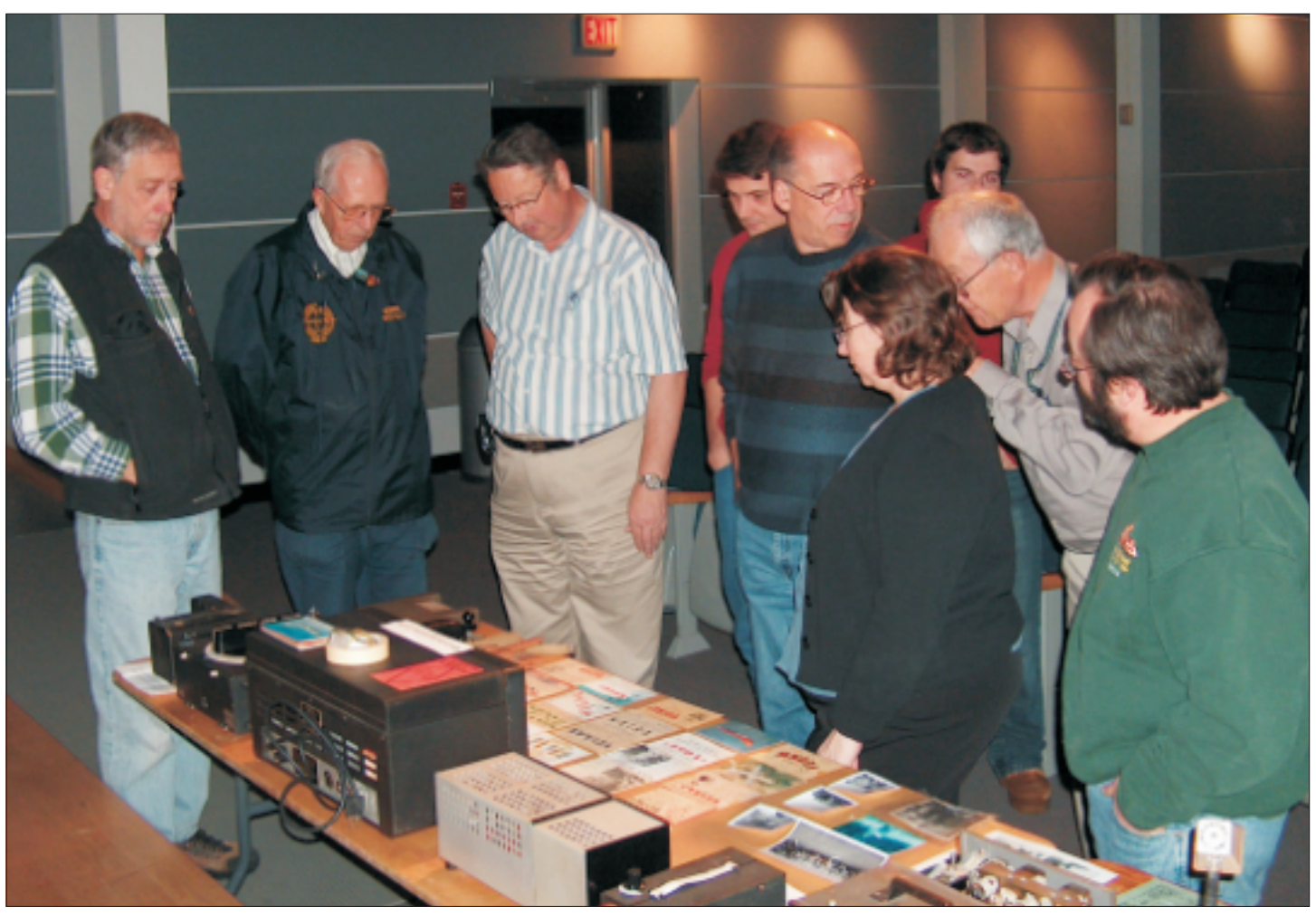
OVMRC Amateur Radio Course Students looking over Artifacts