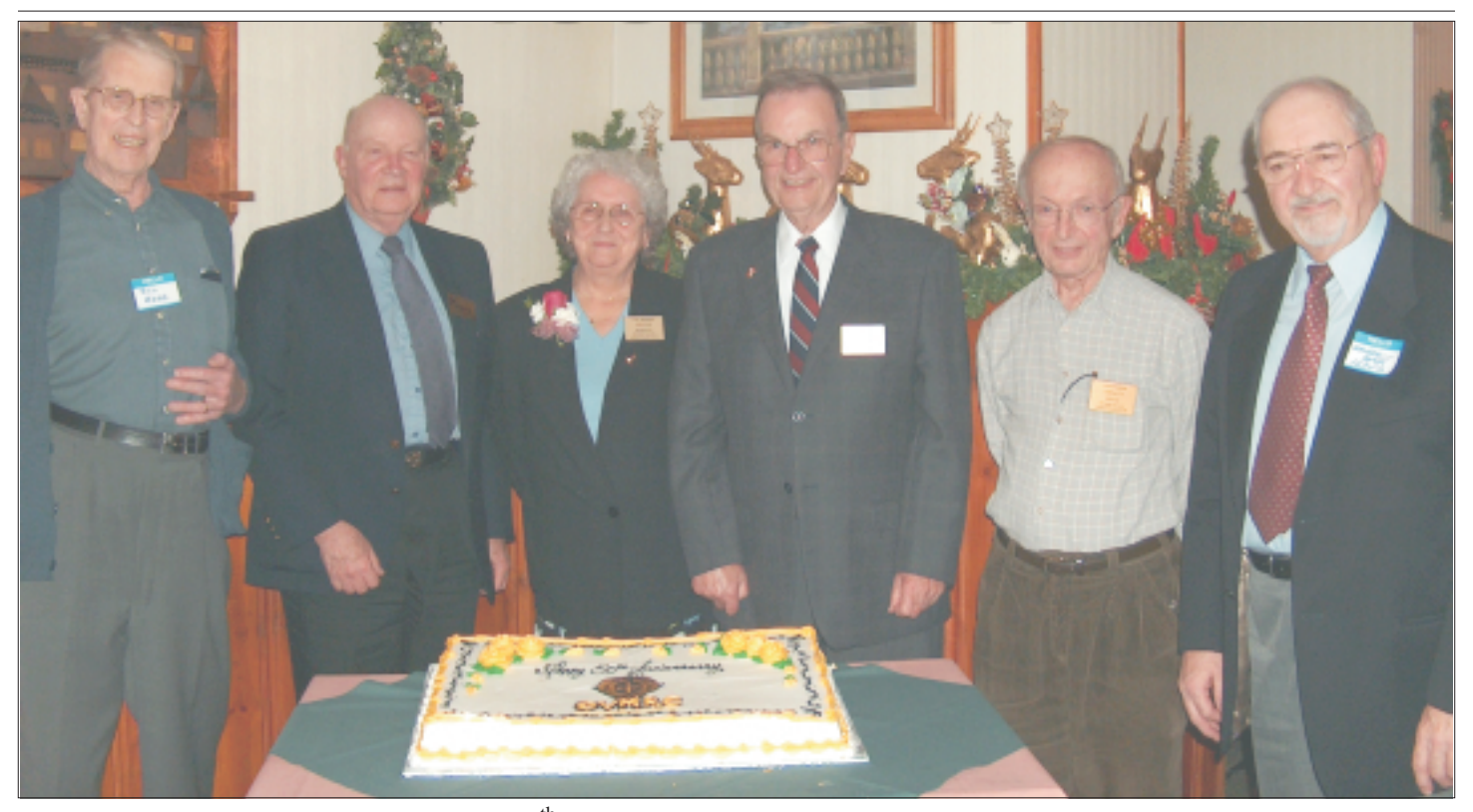
OVMRC Life Members at OVMRC 50<sup>th</sup> Anniversary Dinner Party

December 2007 Volume: 52 Edition: 5 Page: 1