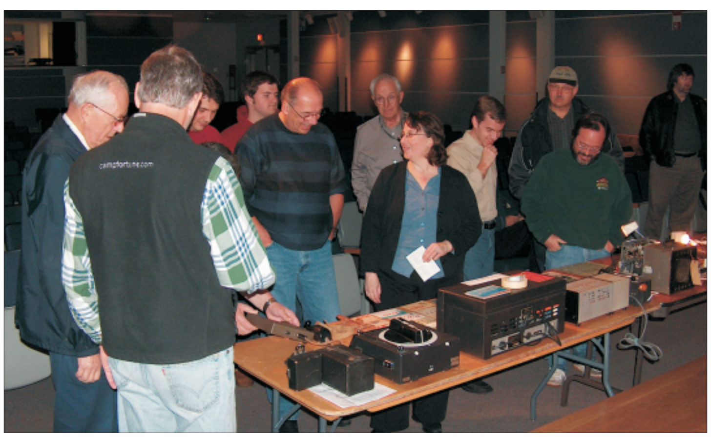
OVMRC Amateur Radio Course Students looking over Artifacts