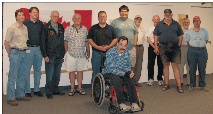
OMVRC 2005 - 2006 Executive

http://strategis.ic.gc.ca/epic/internet/insmt-gst.nsf/en/sf08432e.html and the "Latest News" page on the RAC web site at http://www.rac.ca .