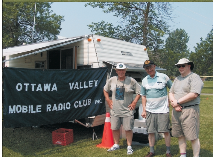
Field Day 2005