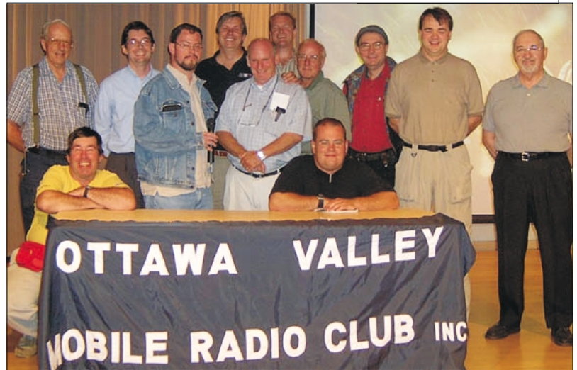
OVMRC 2004/2005 Executive