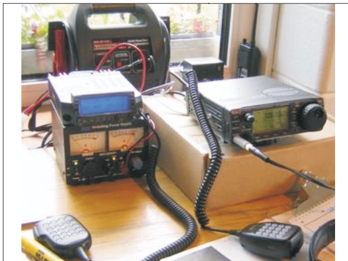
Part of the Amateur Comms Station

On top of the building we had 2 dual band mag mount antenna for 2m/70cm voice communications. On the right side was a dual band Ground plane antenna that was for 2m APRS. A large Telescopic masting held 2 air band antennas.