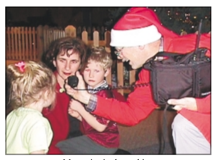
Memories in the making