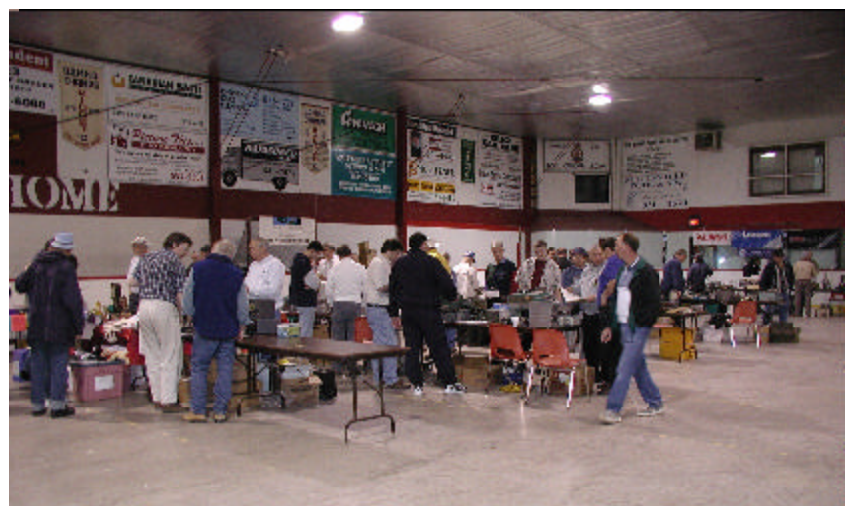
Busy Bargain Hunters !