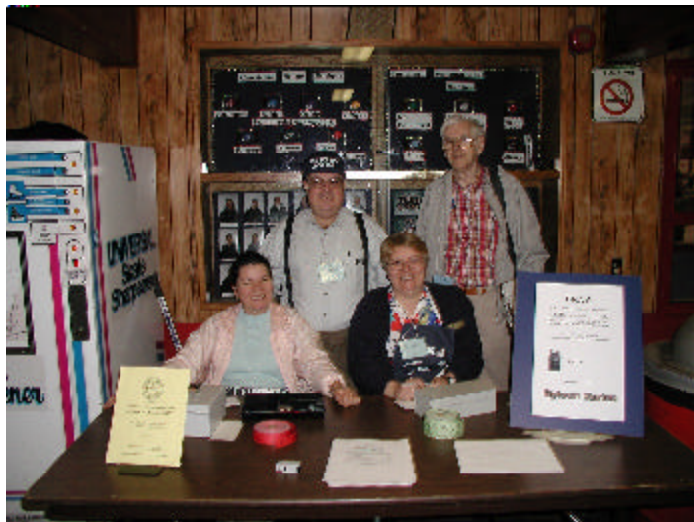
Happy Fleamarket workers & their leader.