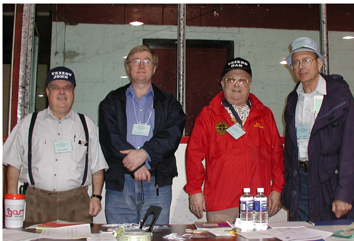
Friendly Fleamarket Workers