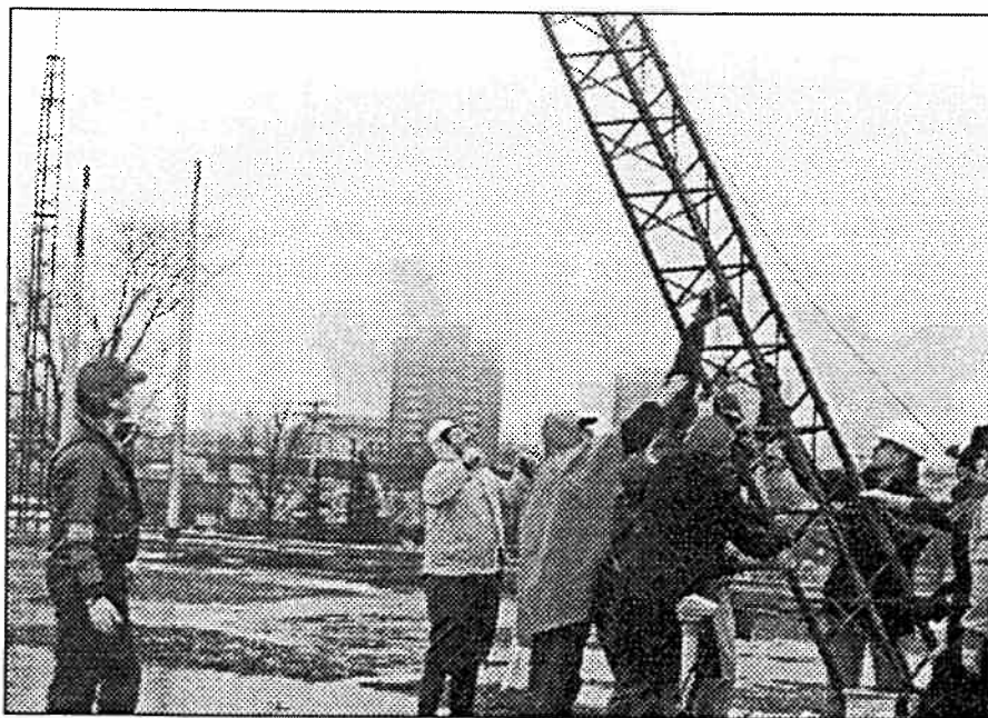
Dedicated ham had to be shaken off tower